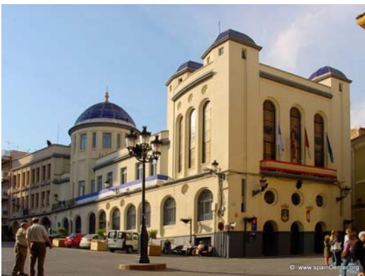
HELLÍN TOWN HALL